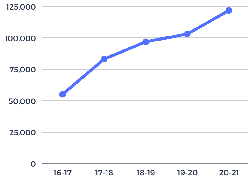
Research guide views, 2016-2021

2020-2021 brought many unexpected changes to the library instruction program. COVID-19 transitioned all instruction online, the library lost a librarian and large contributor to instruction, and the University experienced an 11% decrease in total undergraduate enrollment. It is these circumstances that led to a 62% decrease in instruction sessions in 2020-2021.