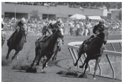
Horse race at Sonoma County Fair, undated