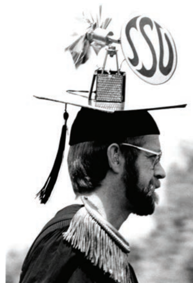
SSU graduate, 1987

Visit the Library's third floor to enjoy these new exhibits.